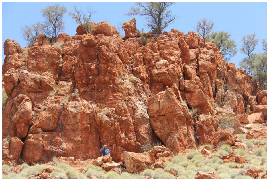
Figure 3: Outcropping pegmatites at Mt Francisco