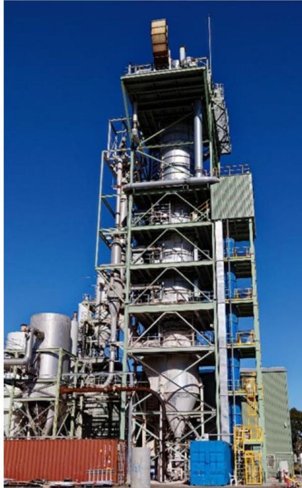
Above: The Calix Flash Calciner and Electric Pilot Scale Plant (BATMn Reactor)

Further, the Calix flash calcination technique is particularly well-suited to the finer fraction of the fines flotation concentrate at Pilgangoora (less than 75 \mu m). This is very encouraging as it has the potential to solve for an existing challenge for the industry when dealing with flotation products through conventional calcining technology.