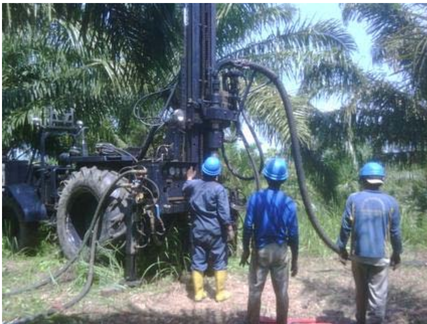
The PT DrillCorp Internusa Aircore Drill Rig on Site at Seluma

Drilling commenced on 29 July 2009 using a PT DrillCorp Internusa aircore drill rig and is expected to continue until late August. Samples are being dispatched to Intertek Indonesia's laboratory in Jakarta for XRF analysis. Initial results are expected to be received toward the end of the third quarter 2009.